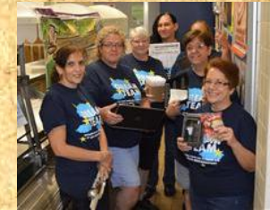
DAVIS FOOD SERVICES